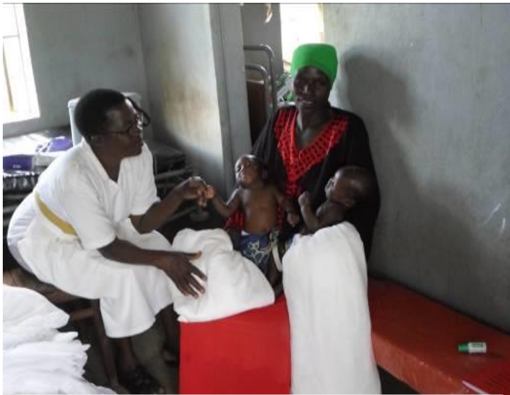
A mother receiving nets for her twins during immunization at the Health Unit