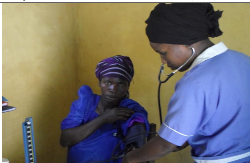
A Nurse examining an expectant mother