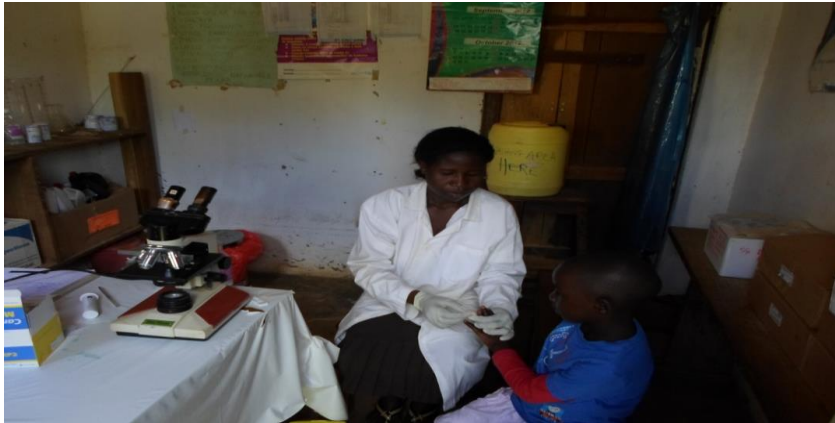
A Lab Assistant at work in the Laboratory

THE TABLE BELOW SHOWS THE NUMBER OF TEST CARRIED IN THE LABORATORY